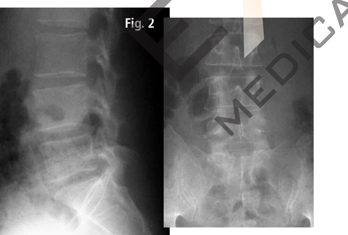
Fig. 2: Lateral & AP weight-bearing lumbar spine radiographs revealing a mild levorotatory lumbar scoliosis with right lateral flexion and left posterior rotation of L4 upon L5. Note the flattening of the lumbar lordosis with approximately 50% loss of disc space present at the L5/S1 level. These changes are thought to be an antalgic posture. No other signs of degenerative change are seen in the lumbar spine.

During this trial of divergent care, plain film radiographs and MR images of the lumbar spine were obtained. The radiographs were performed in the weight-bearing position and included anteroposterior and lateral projections. They revealed a slight levorotatory lumbar scoliosis and significant flattening of the lumbar lordosis. These films suggest an acute clinical presentation. The disc space at L5/S1 demonstrated approximately 50% loss of height; no other signs of degenerative change were seen (i.e. sclerosis, spondylophytosis) (Fig. 2). The MRI was performed on an upright unit and the images were taken in the neutral seated (weight-bearing) position using standard imaging protocols. The T1- and T2-weighted sagittal and axial images were reviewed by a chiropractic radiologist and collectively revealed discal dehydration and desiccation at the L4/5 level with underlying degenerative bulging of the disc. There was no disc herniation at this level. A left paracentral disc herniation (extrusion) was present at the L5/S1 level, which posterolaterally displaced the left